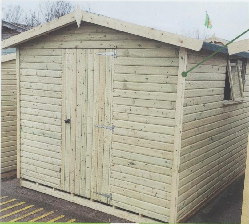
Wrap Around Corner Strips