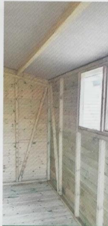
Extra framework and braced corners