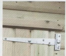
Silver galvanised BOLTED hinges