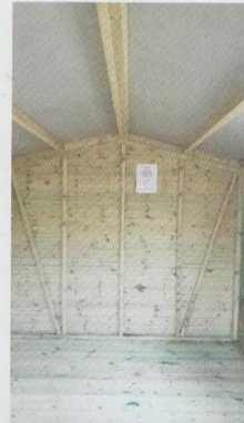
Breathable membrane in roof