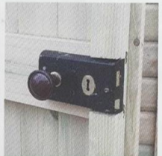
3 Lever mortice lock and handle